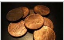
Solar Power Almost as Cheap as Natural Gas in Six States