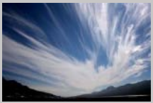
How Denmark Will Integrate 50% Wind Power by 2025