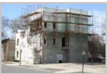
Home with Insulated Panels and Geothermal Will Use Half the Electricity, No Gas