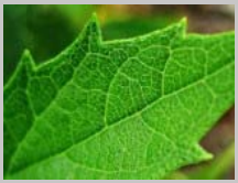
Yes for Real, We Now Have a Genuine Artificial Solar Leaf