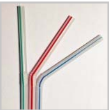
New Solar Thermal System Sucks More Energy from the Sun