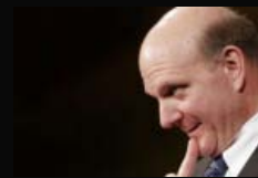
This week at Microsoft: Photosynth, NoDo, and something