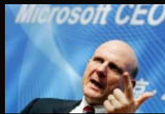
Windows 8's slick login screen [video]