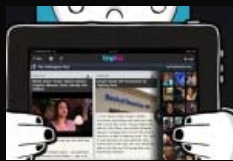
Taptu delivers the news. A lot.