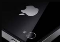
iPhone 5 Mockup Reveals Larger Screen