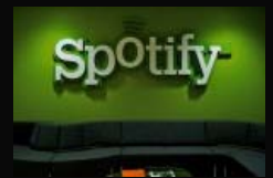
Spotify US gets stronger with Apple deal